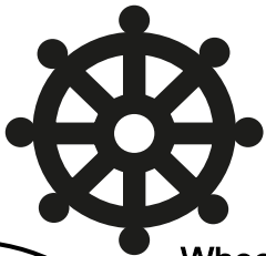
Wheel of Dharma

The Eightfold Path (the middle way ) is a philosophical approach to life with eight guiding principles with the aim of ending suffering and reaching enlightenment.